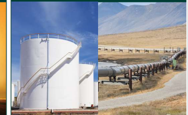
Transportation, processing, and storage of crude oil, natural gas, and products