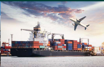
Air Freight and Logistics