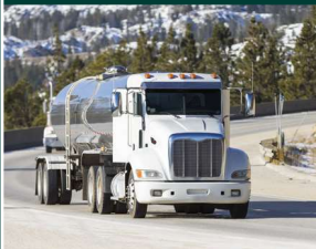
Road and Rail