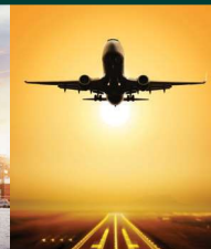
Airlines & Marine