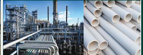
Chemicals, Container and Packaging, Construction Materials