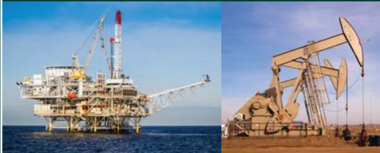
Exploration & Production (E&P), Energy Equipment and Services, Oil & Gas Refining and Marketing