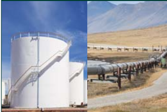
Transportation, processing, and storage of crude oil, natural gas, and products