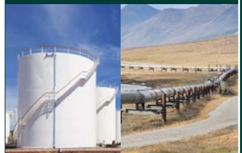
Transportation, processing, and storage of crude oil, natural gas, and products