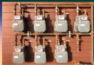
Natural Gas Transmission