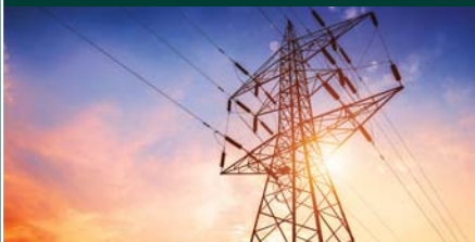
Electric Generation and Transmission