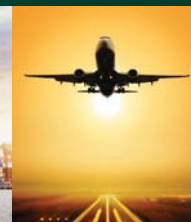
Airlines & Marine