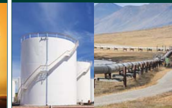
Transportation, processing, and storage of crude oil, natural gas, and products