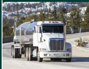
Road and Rail