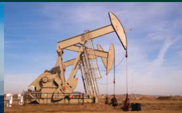
Energy Equipment and Services