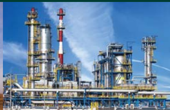
Oil & Gas Refining and Marketing