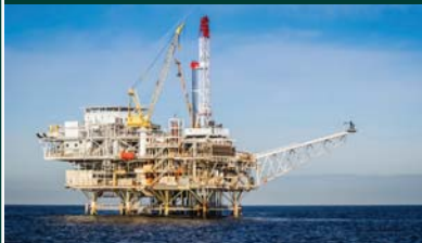
Exploration and Production (E&P)