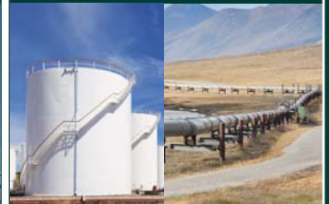
Transportation, processing, and storage of crude oil, natural gas, and products