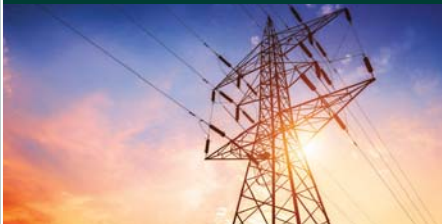
Electric Generation and Transmission