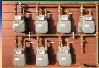
Natural Gas Transmission