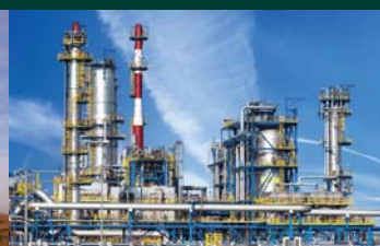
Oil & Gas Refining and Marketing