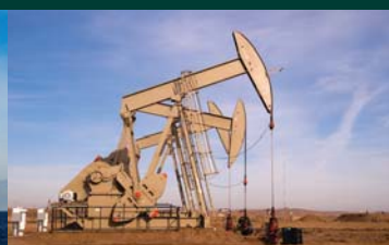
Energy Equipment and Services