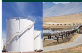
Transportation, processing, and storage of crude oil, natural gas, and products