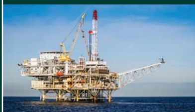
Exploration and Production (E&P)