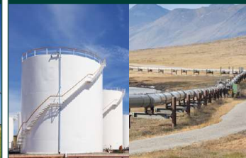
Transportation, processing, and storage of crude oil, natural gas, and products