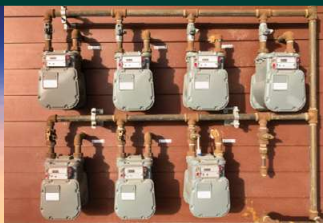
Natural Gas Transmission