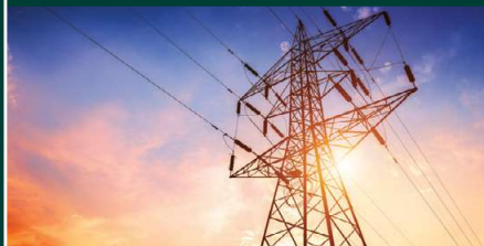
Electric Generation and Transmission