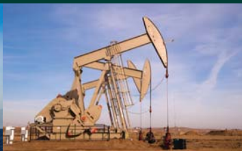
Energy Equipment and Services