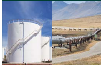
Transportation, processing, and storage of crude oil, natural gas, and products