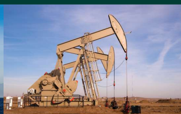
Energy Equipment and Services