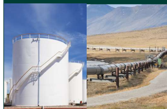
Transportation, processing, and storage of crude oil, natural gas, and products