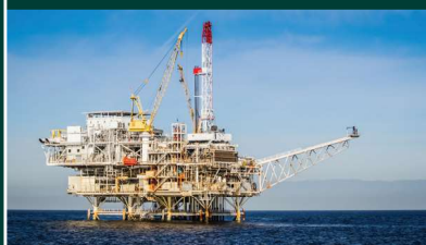
Exploration and Production (E&P)