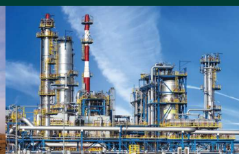
Oil & Gas Refining and Marketing