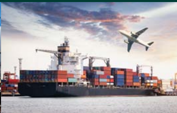
Air Freight and Logistics