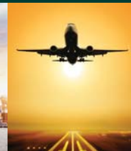
Airlines & Marine