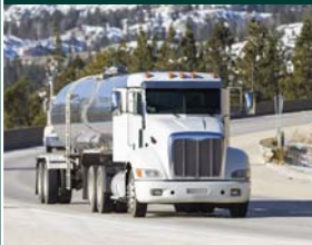
Road and Rail