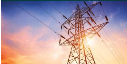
Electric Generation and Transmission