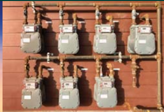
Natural Gas Transmission