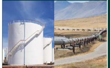
Transportation, processing, and storage of crude oil, natural gas, and products