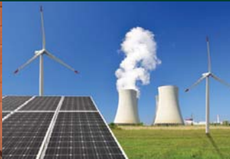
Independent Power and Renewable